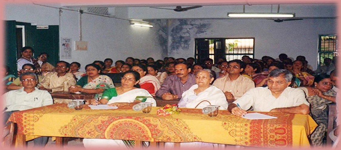
FACULTY MEMBERS, STUDENTS ALONG WITH NAAC VISIT TEAM – 2004

The college is situated near B.T. College Bus Stand (4 to 5 minutes walking distance), New Barrackpur, Kolkata – 700131. It is about 2 km. from New Barrackpur Railway Station. Auto rickshaws / Rickshaws are available to reach the college from both Bus Stand & Railway Station.